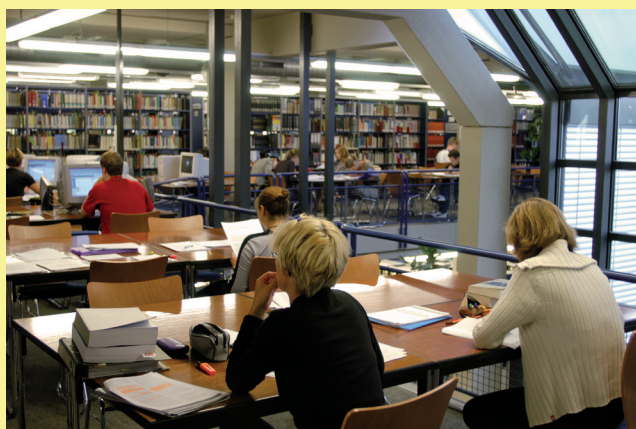
In one of the seven branches of the university library

Cultural development of Anglophone regions of the world