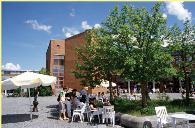
In front of the students' cafeteria