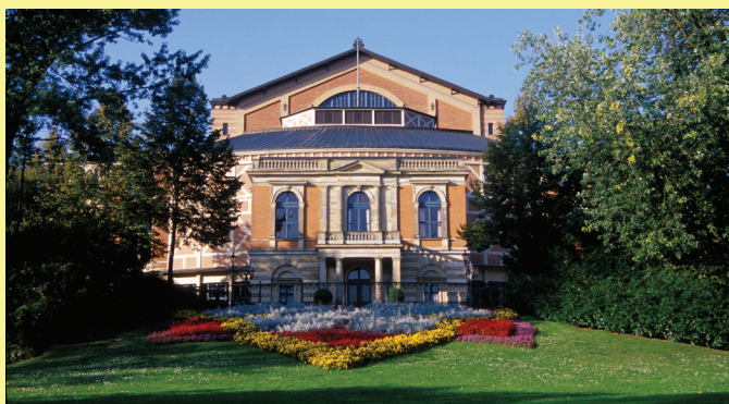
Bayreuth is culture: Richard Wagner's famous Festspielhaus