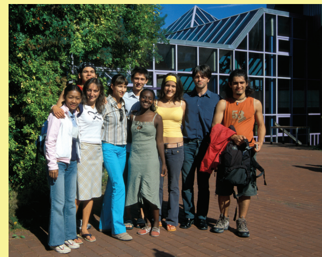
Students of the International Summer University

Each summer, the University offers an international Summer University to prepare students for studies in Germany and for German language qualification. MA students are welcome to apply for membership, to ease their pathway into the German system.